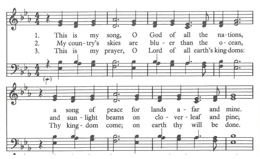
This is my song